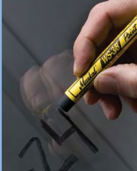
Mark Size 9.5mm