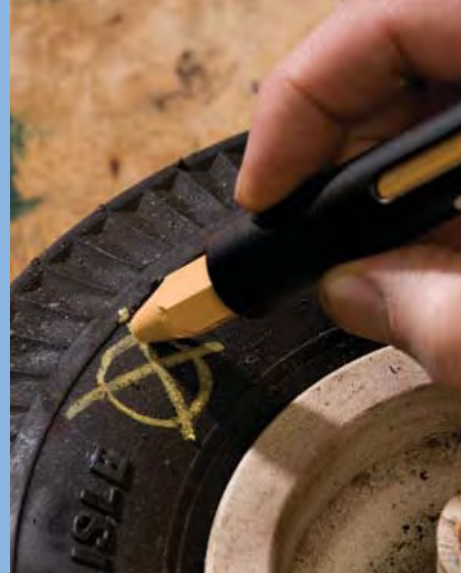
Mark Size 12.7mm

◆ Marking range: -50°F to 150°F (-46°C to 66°C)